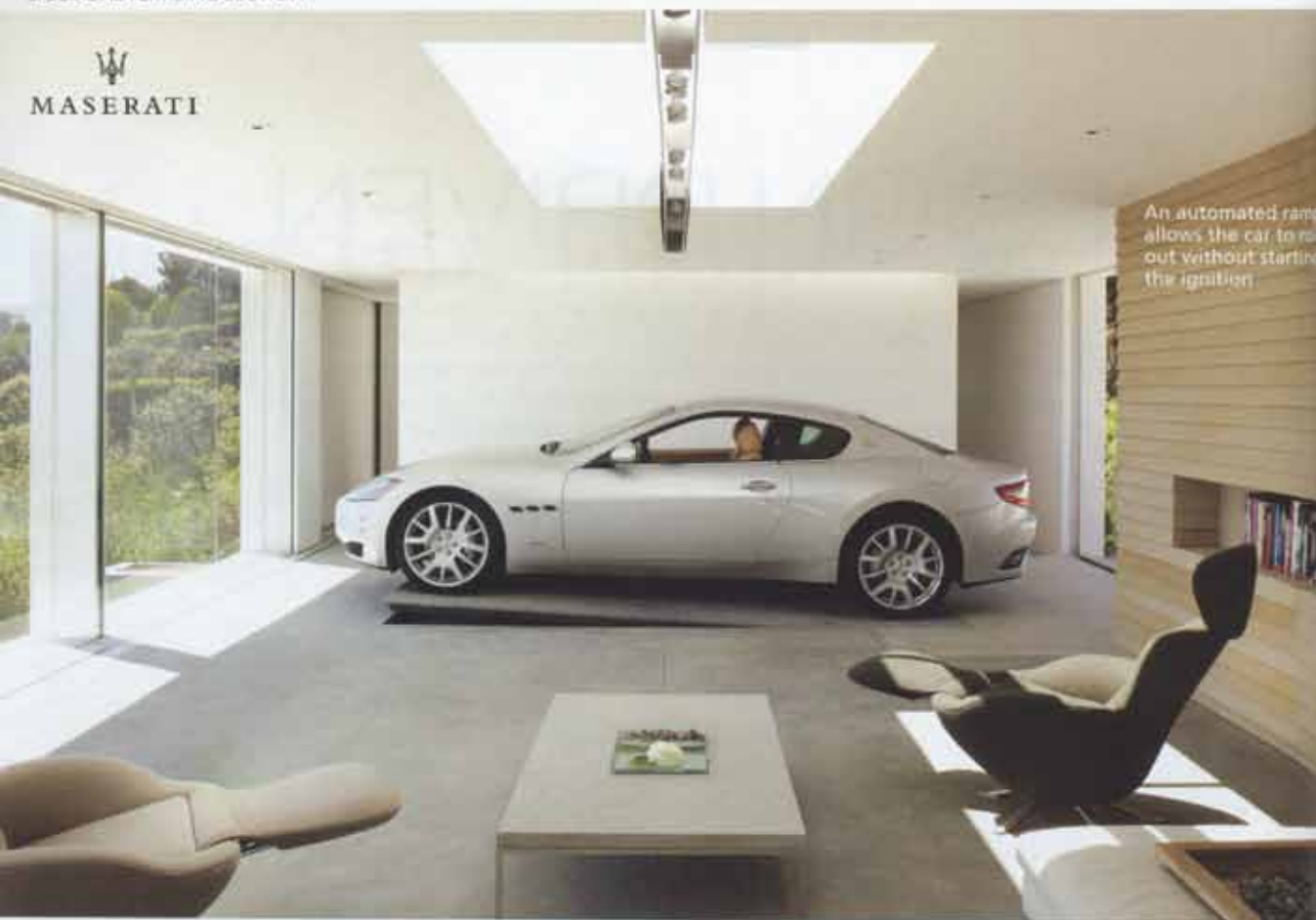
An automated ramp allows the car to roll out without starting the ignition.