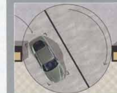
Altman's renderings with rotation detail.