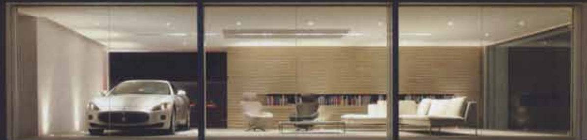
At nightfall, the garage appears to float when admired from the lower residence.

U pon hearing of the Design Driven contest, architect Holger Schubert decided his garage must take precedence over all other construction on his canyon-side, multi-acre residence. This space became the first of five buildings completed at his new Los Angeles home. Schubert constructed the winning design in a mere 84 days, entering the contest at the wire—only eight minutes before the deadline.