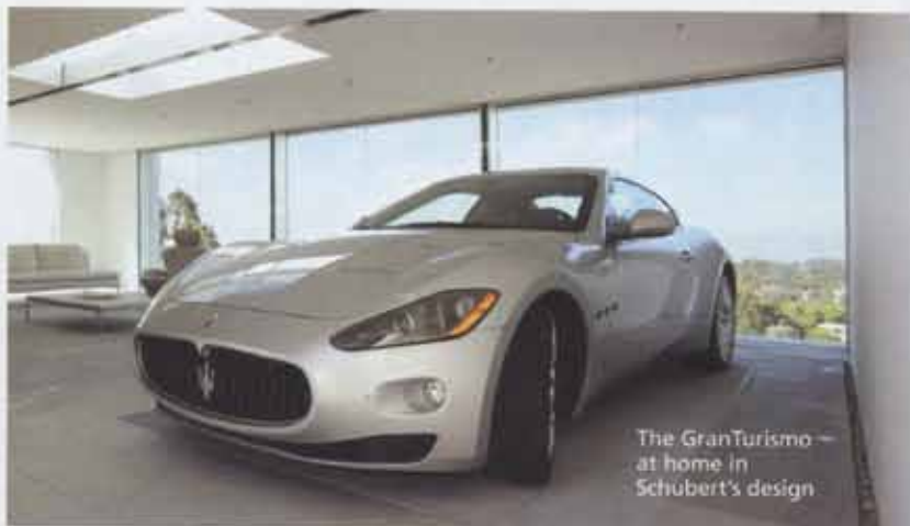
The GranTurismo at home in Schubert's design.

A glazed gate holds the mystery from the street. With the touch of a button, the gate opens and Schubert receives access, driving across a sleek, glass-sided bridge to arrive home. Inside, more glass